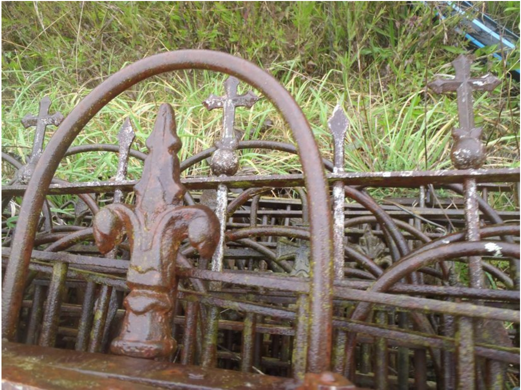
DECORATIVE IRONWORK SYMBOLISES UNMARKED GRAVES.