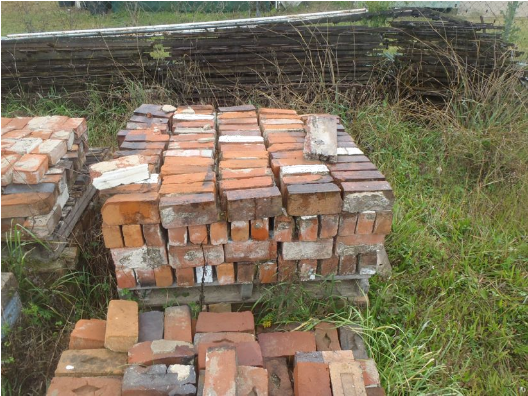
TENTERFIELD BRICK FOR EDGING TO THE DECOMPOSED GRANITE PATH.