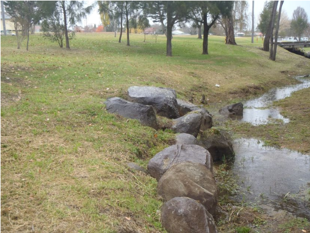
TENTERFIELD STONE USED TO ACCENT THE AREA OF THE MEMORIAL.

NOTE: LOCATION OF EXISTING SITE FEATURES APPROXIMATE ONLY. SITE SURVEY REQUIRED.