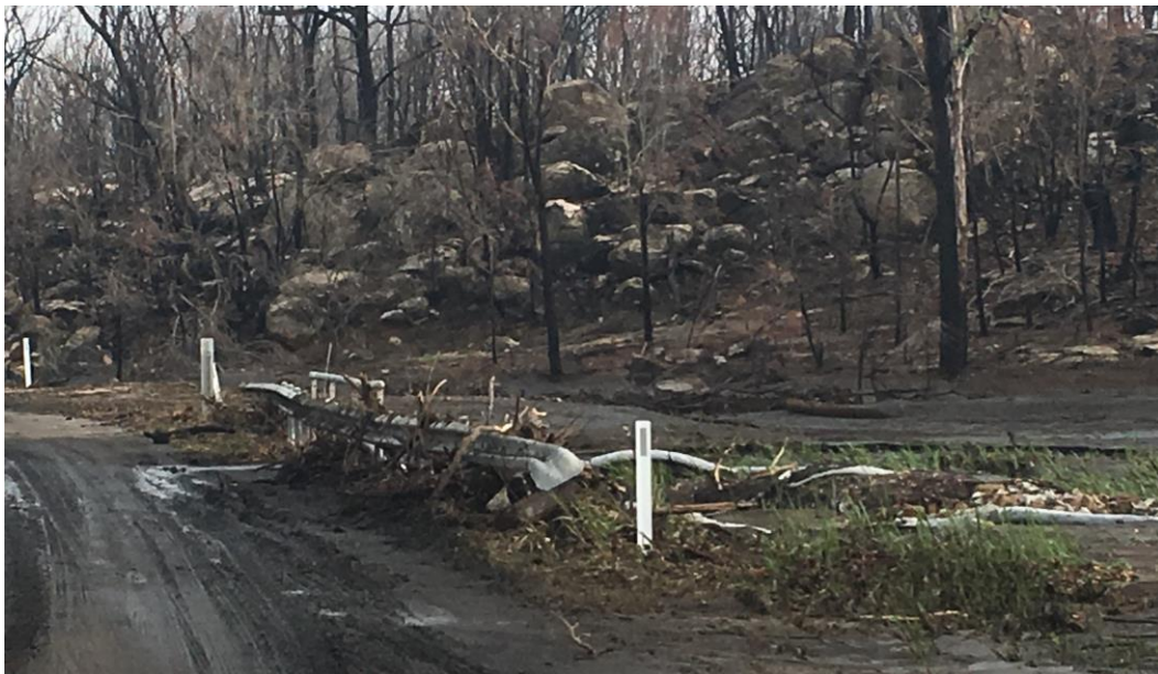
Figure 1: Debris on Scrub Road entering dam water after the fires

A reverse osmosis system is currently being installed. The new plant will treat all water sourced from the bores and strips out all contaminants. The plant is similar to those used by the Defence Forces and mining companies to ensure good quality water from sources which are less than satisfactory.