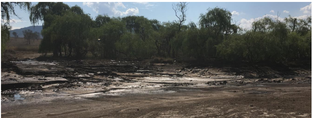
Figure 2: Fire ground run off