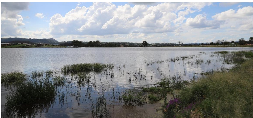
Figure 3: Tenterfield Dam 16 February 2020