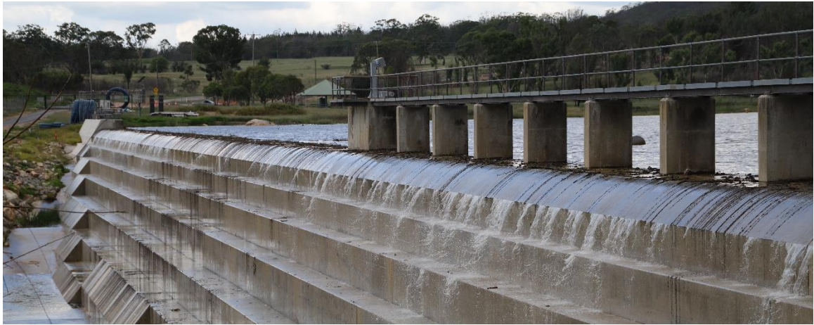
Figures 1 and 2: Water flowing over the dam wall 16 February 2020

Good rains in February meant that the dam overflowed for the first time since December 2017. As a result we have seen an increase in water quality and made the need for pumping water from the bores to be put on hold. The RO plant has been mothballed while COV-19 impacts operations.