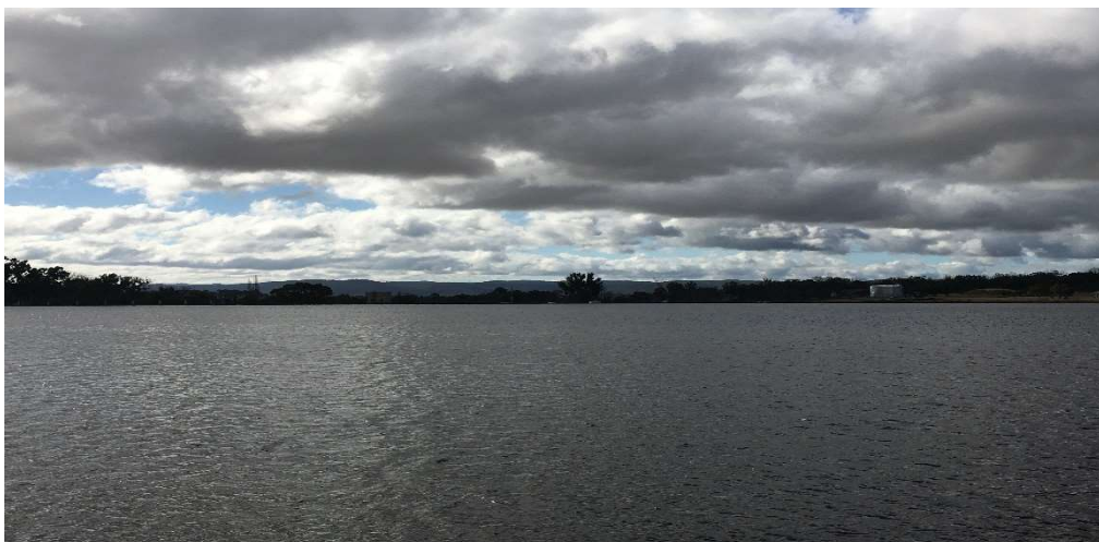
Figure 3: Tenterfield Dam 7 May 2020