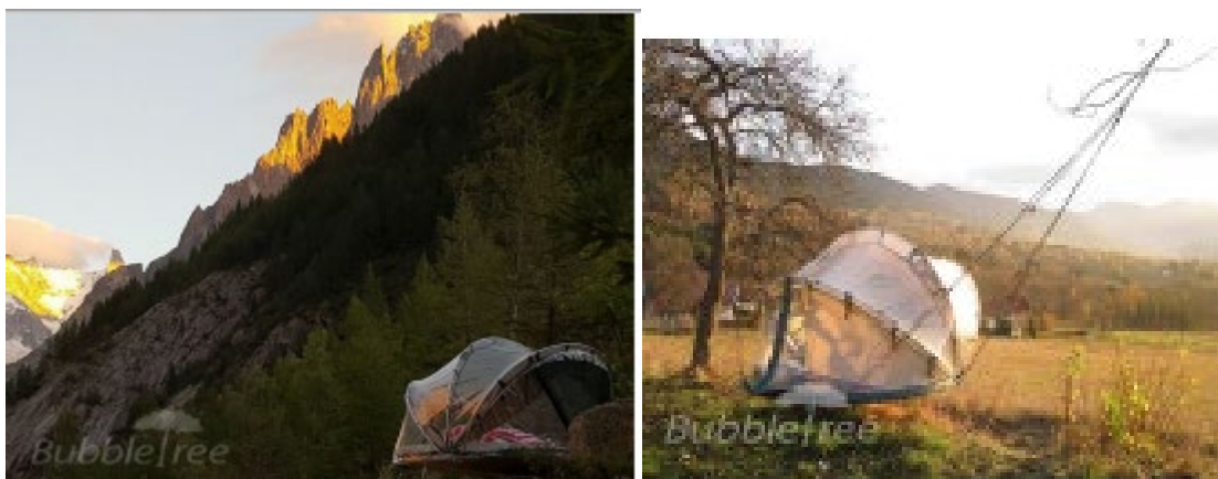
Figure 4 and 4a