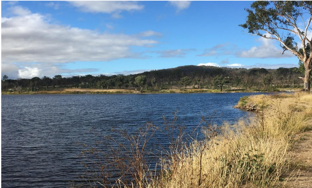
Figure 1: Water Level South-eastern end of Dam June 2020

Good rains in February meant that the dam overflowed for the first time since December 2017. As a result we have seen an increase in water quality and made the need for pumping water from the bores to be put on hold. The RO plant has been reactivated to continue the testing regime, as laboratories have now opened as COVID-19 still impacts operations.