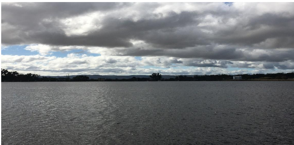
Figure 3: Tenterfield Dam 7 May 2020