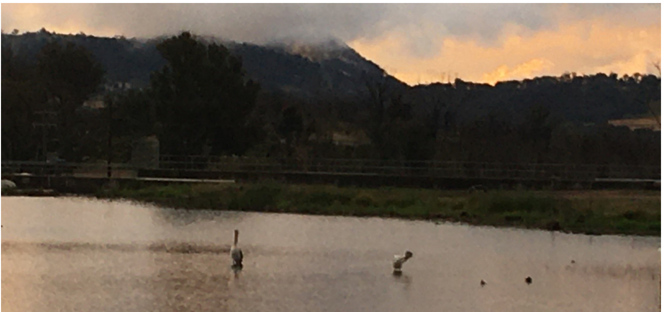
Figure 1: View to West of Dam after rain October 2020

Good rains in February meant that the dam overflowed for the first time since December 2017 and continued rainfall in July and August 2020. As a result we have seen an increase in water quality and made the need for pumping water from the bores to be put on hold. The RO plant has been reactivated to continue the testing regime, as laboratories have now opened as COVID-19 still impacts operations.