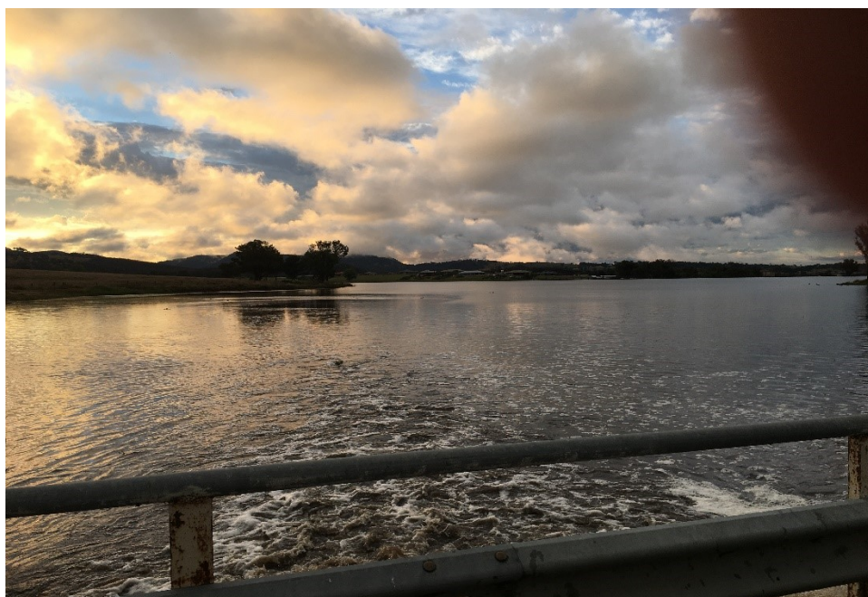
Figure 2: Tenterfield Dam Inflow from Scrub Road 27 October 2020