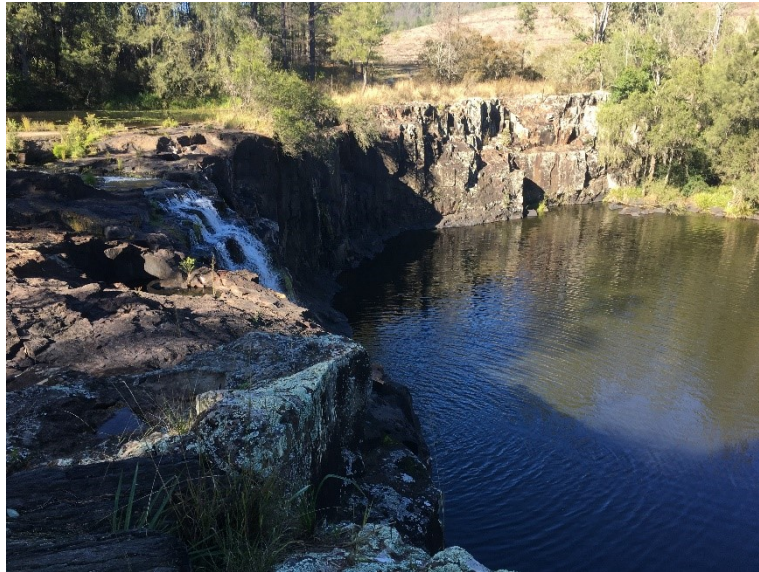
Figures 1 and 2: Water flowing over the Tooloom Falls and Weir June 2020

Good rains in February meant that the weir overflowed for the first time since December 2017 and continued rainfall in July and August 2020. As a result we have seen an increase in water quality.