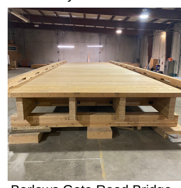
Barlows Gate Road Bridge Under Construction