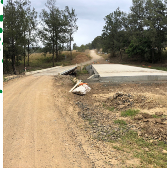
Emu Creek, Hootons Road