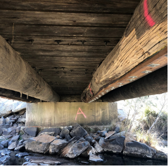
Castlerag Rd, Deepwater River

Right: Cheviot Hills Road, Fairfield Creek