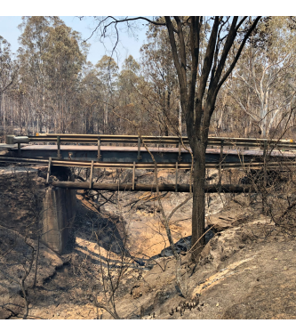
Fire Damage to Paddys Flat Road North