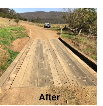
Mount Clunie Rd, Woodenbong Creek