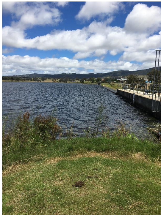
Figure 1: View of Dam Wall 17 February 2021

Good rains in February meant that the dam overflowed for the first time since December 2017 and continued rainfall in July, August and October 2020. As a result we have seen an increase in water quality and made the need for pumping water from the bores to be put on hold. The RO plant has been reactivated to continue the testing regime, as laboratories have now opened as COVID-19 still impacts operations.