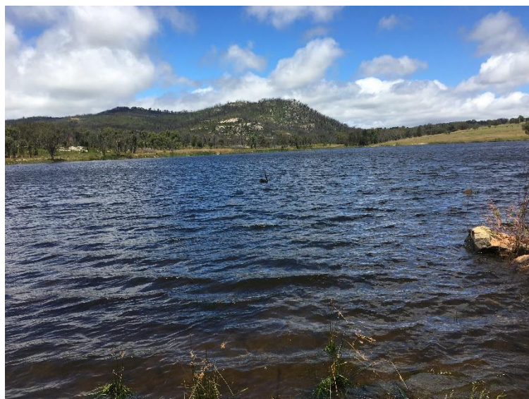
Figure 2: View to South East Tenterfield Dam 17 February 2021