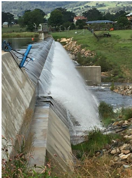
Figure 1: Tenterfield Dam Overtopping side view 5 January2021

Good rains in February meant that the dam overflowed for the first time since December 2017 and continued rainfall in July, August and October 2020. As a result we have seen an increase in water quality and made the need for pumping water from the bores to be put on hold. The RO plant has been reactivated to continue the testing regime, as laboratories have now opened as COVID-19 still impacts operations.