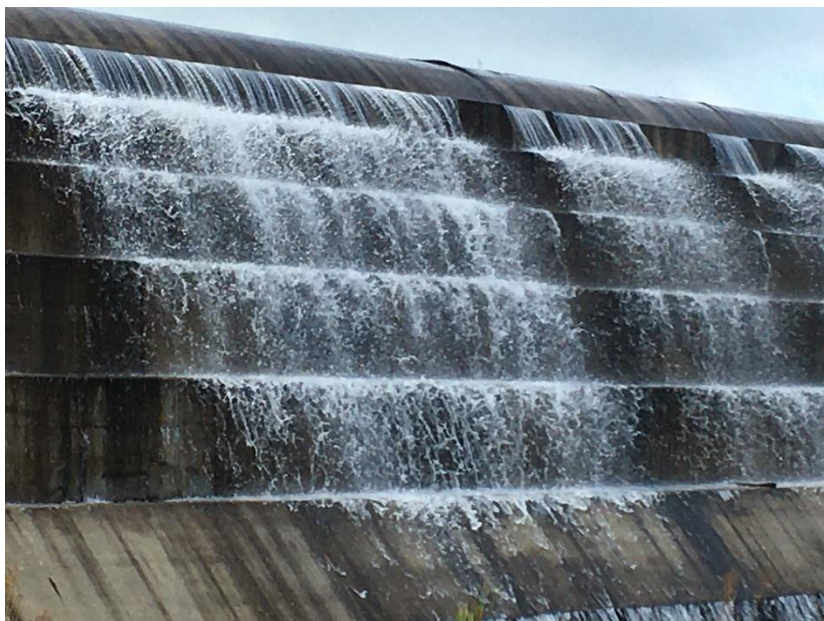
Figure 2: Tenterfield Dam Overtopping 5 January2021