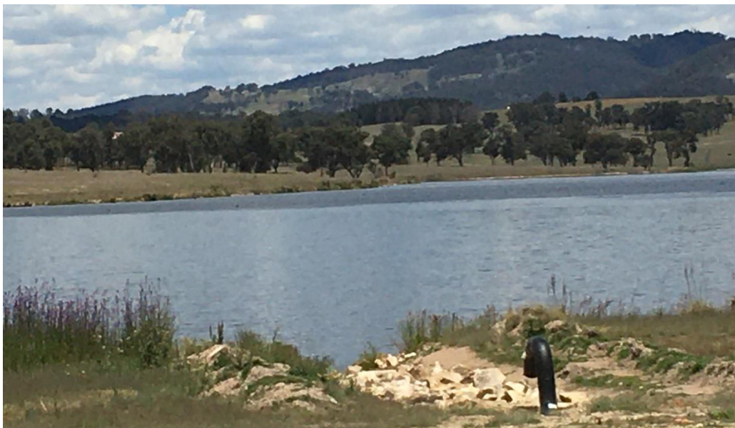
Figure 1: View to South of Dam November 2020

Good rains in February meant that the dam overflowed for the first time since December 2017 and continued rainfall in July, August and October 2020. As a result we have seen an increase in water quality and made the need for pumping water from the bores to be put on hold. The RO plant has been reactivated to continue the testing regime, as laboratories have now opened as COVID-19 still impacts operations.