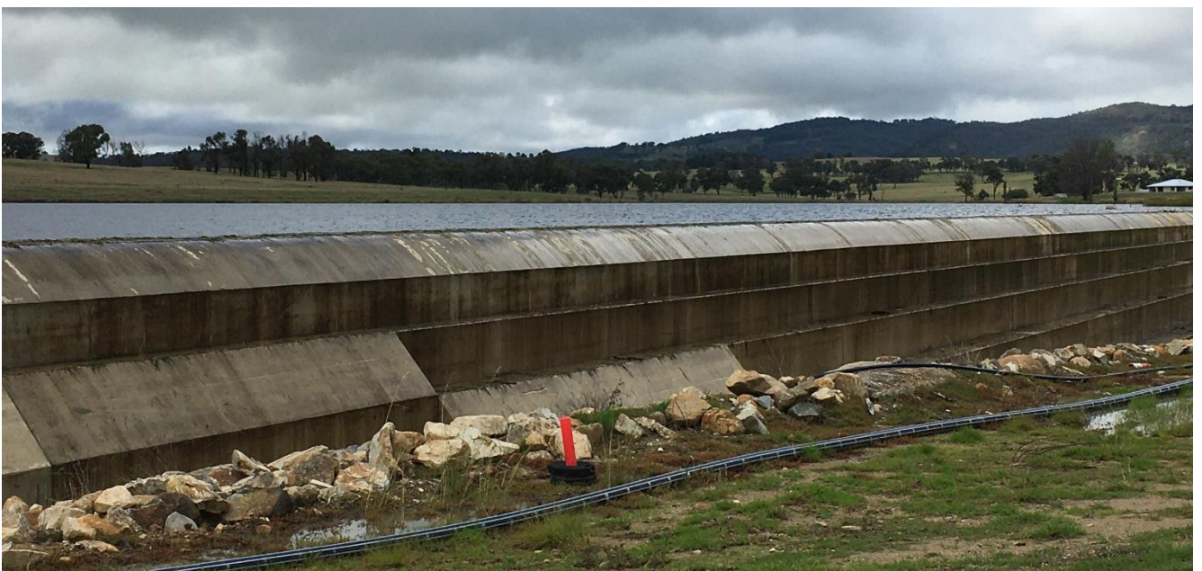
Figure 2: Tenterfield Dam Overtopping 15 December 2020