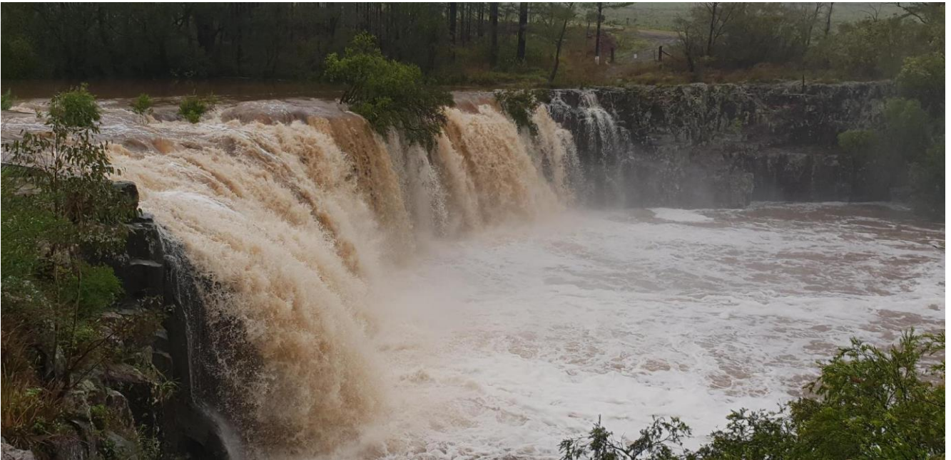
Figures 1 and 2: Water flowing over the Tooloom Falls and Weir January 2021

Good rains in February meant that the weir overflowed for the first time since December 2017 and continued rainfall in July, August and December 2020 including January 2021. As a result we have seen an increase in water quality.