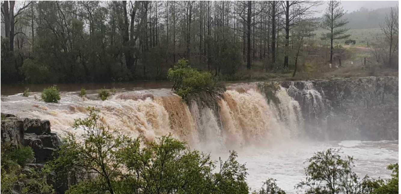
Figures 1 and 2: Water flowing over the Tooloom Falls and Weir December 2020

Good rains in February meant that the weir overflowed for the first time since December 2017 and continued rainfall in July, August and December 2020. As a result we have seen an increase in water quality.