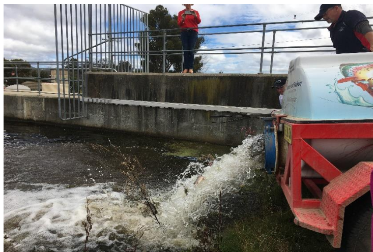
Figure 2: Trout release Tenterfield Dam 30 March 2021