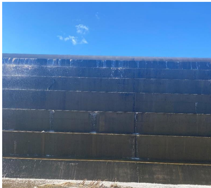
Figure 1: View of Dam Wall 30 March 2021

Good rains in February meant that the dam overflowed for the first time since December 2017 and continued rainfall in July, August and October 2020 continued rains through January to flooding in March 2021 have seen the dam continue to overtop. As a result we have seen an increase in water quality and made the need for pumping water from the bores to be put on hold. The RO plant has been reactivated to continue the testing regime, as laboratories have now opened as COVID-19 still impacts operations.