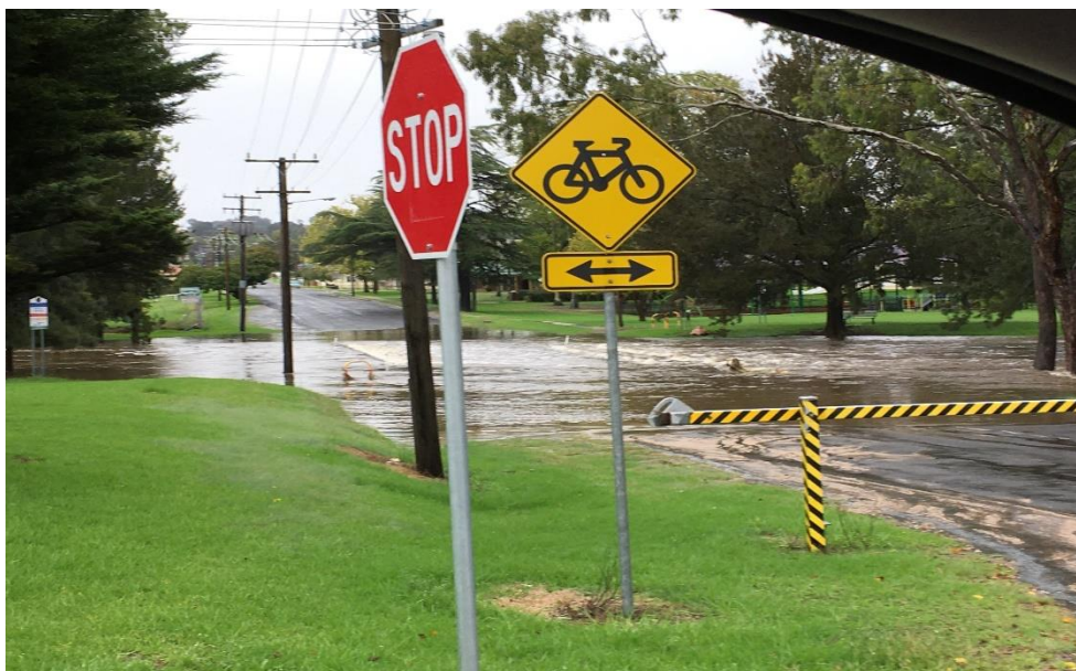
Figure 2: Flooding below the dam 16 April 2021