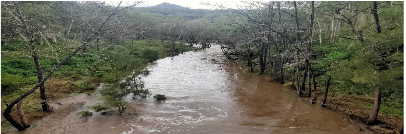
Figures 1 and 2: Water flowing in the Tooloom Creek and water over the Tooloom Falls and Weir January 2021

Good rains in February meant that the weir overflowed for the first time since December 2017 and continued rainfall in July, August and December 2020 including January to March 2021. As a result we have seen an increase in water quality.