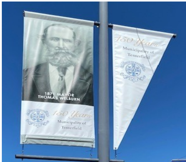
Photo: 150th Anniversary of the Commemoration of the Proclamation of the Municipality of Tenterfield Banners along Rouse Street.

To attend you must QR code/sign in, wear a mask, be double vaccinated and observe social distancing.