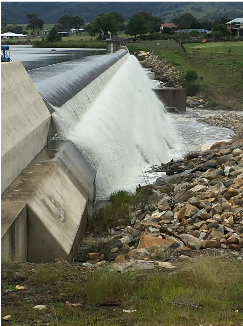
Figure 1: View of Dam Wall November 2021

Good rains and continued rainfall in July, August and October 2020 continued rains through January to with flooding in October and November 2021 have seen the dam continue to overtop. As a result we have seen a decrease in water quality and made the need for pumping water from the bores to be put on hold. The RO plant has been reactivated to continue the testing regime, as laboratories have now opened as COVID-19 still impacts operations.