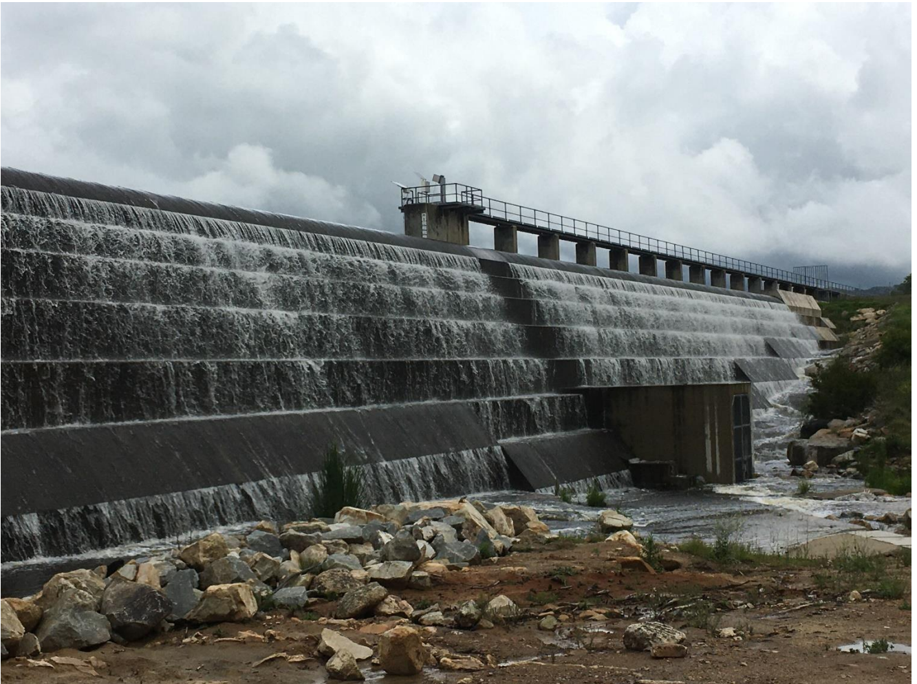
Figure 1: View of Dam Wall October 2021

Good rains and continued rainfall in July, August and October 2020 continued rains through January to October 2021 have seen the dam continue to overtop. As a result we have seen an increase in water quality and made the need for pumping water from the bores to be put on hold. The RO plant has been reactivated to continue the testing regime, as laboratories have now opened as COVID-19 still impacts operations.