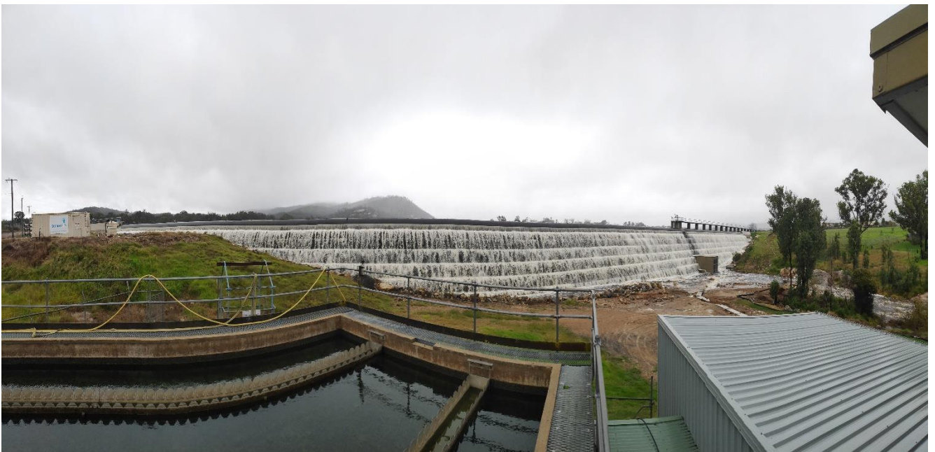
Figure 1: View of Dam Wall 9 April 2021

Good rains in February meant that the dam overflowed for the first time since December 2017 and continued rainfall in July, August and October 2020 continued rains through January to September 2021 have seen the dam continue to overtop. As a result we have seen an increase in water quality and made the need for pumping water from the bores to be put on hold. The RO plant has been reactivated to continue the testing regime, as laboratories have now opened as COVID-19 still impacts operations.