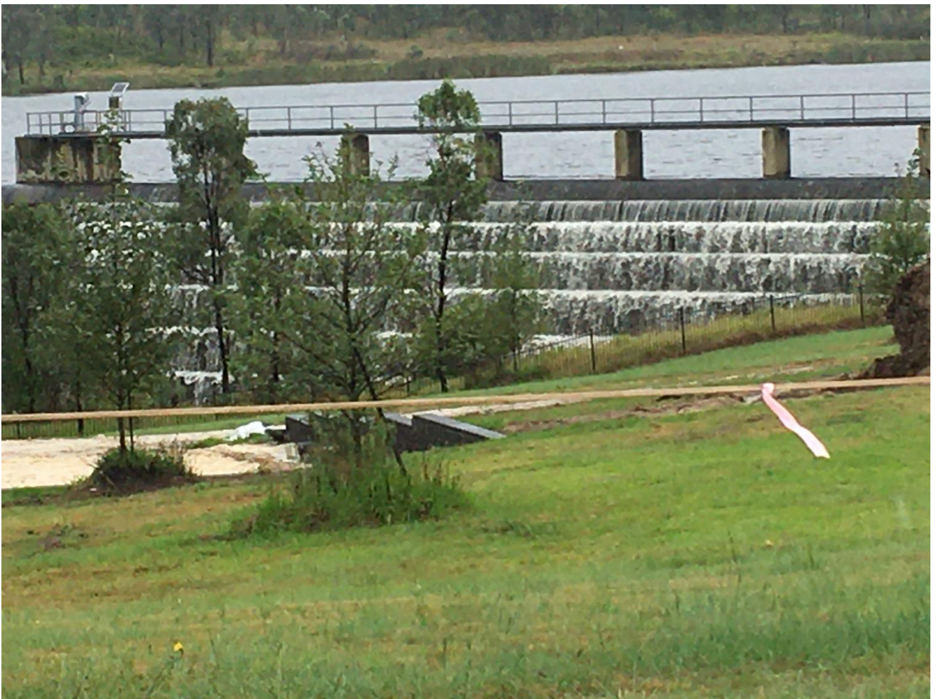
Figure 1: View of Dam Wall February 2022

Good rains and continued rainfall in January to with flooding in October and November 2021 continuing into February 2022 that have seen the dam continue to overtop. As a result we have seen a decrease in water quality and made the need for pumping water from the bores to be put on hold. The RO plant has been reactivated to continue the testing regime, as laboratories have now opened as COVID-19 still impacts operations.