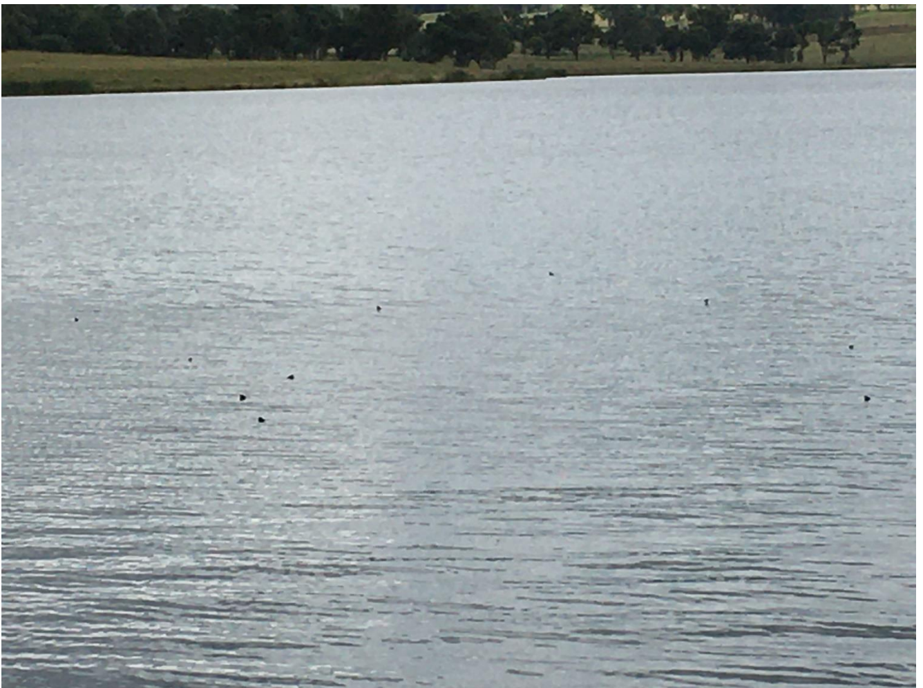
Figure 1: View of Dam with turtles January 2022

Good rains and continued rainfall in January with flooding in October and November 2021 continuing to January 2022 have seen the dam continue to overtop. As a result we have seen an increase in water quality and made the need for pumping water from the bores to be put on hold. The RO plant has been reactivated to continue the testing regime, as laboratories have now opened as COVID-19 still impacts operations.