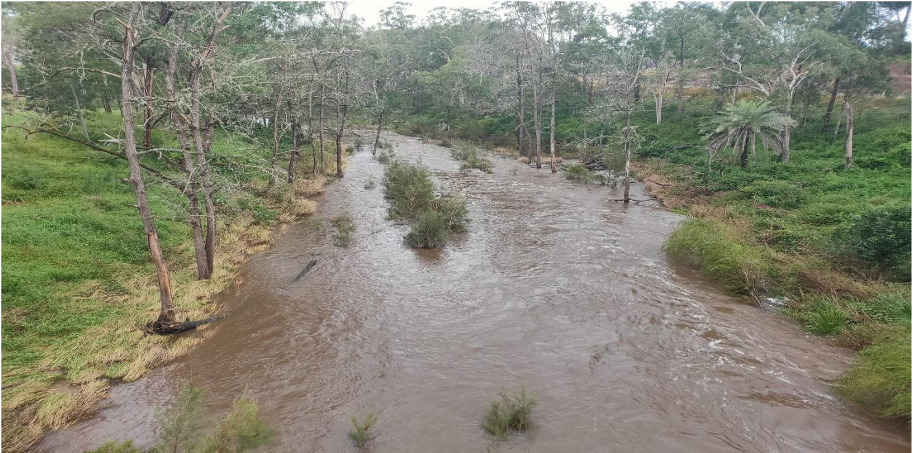
Figures 1 and 2: Water flowing in the Tooloom Creek and over the Tooloom Falls and Weir April 2021

Good rains in February meant that the weir continues to overflow from January to November 2021 and December to February 2022. As a result we have seen an increase in water quality.