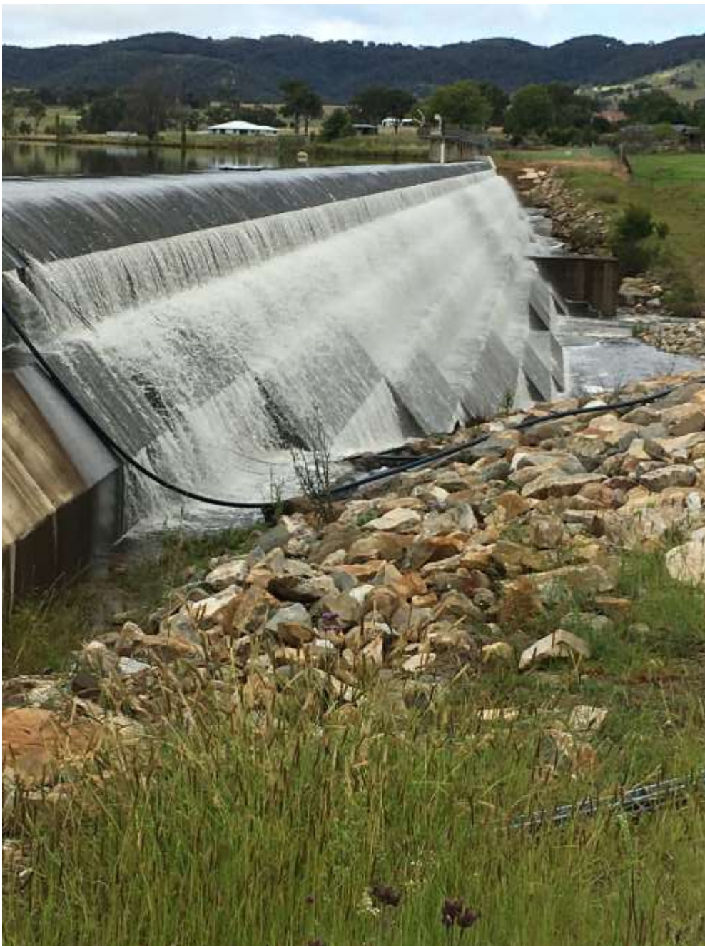
Figure 1: View of Dam Wall March 2022

Good rains and continued rainfall in January to with flooding in October and November 2021 continuing into May 2022 that have seen the dam continue to overtop. As a result, we have seen a decrease in water quality and made the need for pumping water from the bores to be put on hold. The RO plant has been reactivated to continue the testing regime, as laboratories have now opened as COVID-19 still impacts operations.