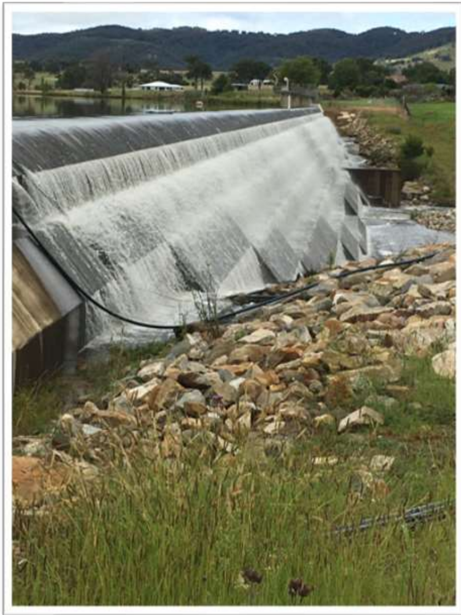
Figure 1: View of Dam Wall March 2022

Good rains and continued rainfall in January to with flooding in October and November 2021 continuing into September 2022 that have seen the dam overtopping. As a result, we have seen a decrease in water quality and made the need for pumping water from the bores to be put on hold. The RO plant has been returned.