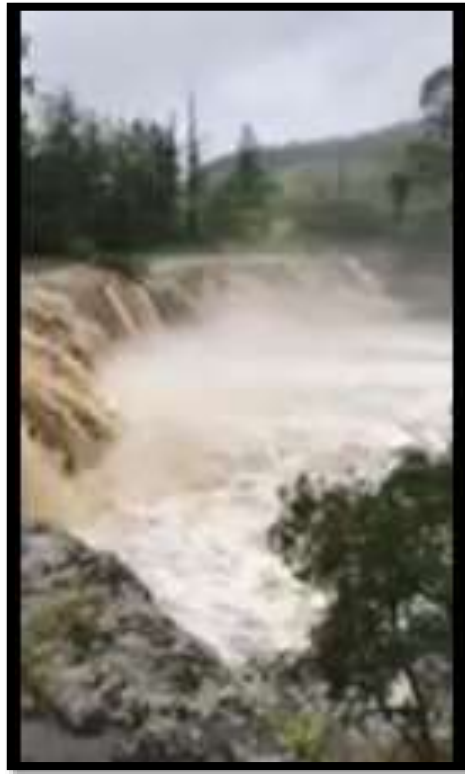
Figures 1 and 2: Water flowing in the Tooloom Creek and over the Tooloom Falls and Weir April 2021 & March 2022

Good, prolonged rain through to August meant that the weir continues to overflow from January to November 2021 and December to August 2022. As a result, we have seen variations in water quality.