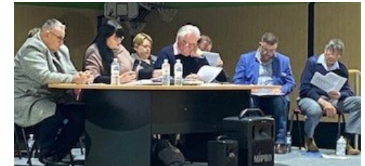
The Chief Executive, Mayor and Councillors addressing questions from approx. 150 members of the public who attended the Community Forum at Tenterfield Memorial Hall, Saturday 3 September 2022

Councillors will now analyse and reflect on the data secured from the meetings and workshops, and make a final resolution at the October Ordinary Council Meeting, then submit their application to IPART (the Independent Pricing and Regulatory Tribunal of NSW).