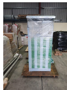
Dispensing Machine ready to be unwrapped

The hydrogeologist report has been completed following initial site inspections. The bores tender for drilling has been awarded and the drilling of bores is expected to commence early next month, pending approvals from NRAR. The bore drilling will commence at Urbenville with the expectation this bore will provide the secondary source required to ensure water for Urbenville and Kyogle into the future. The second site is expected to be Legume under the village bore program.