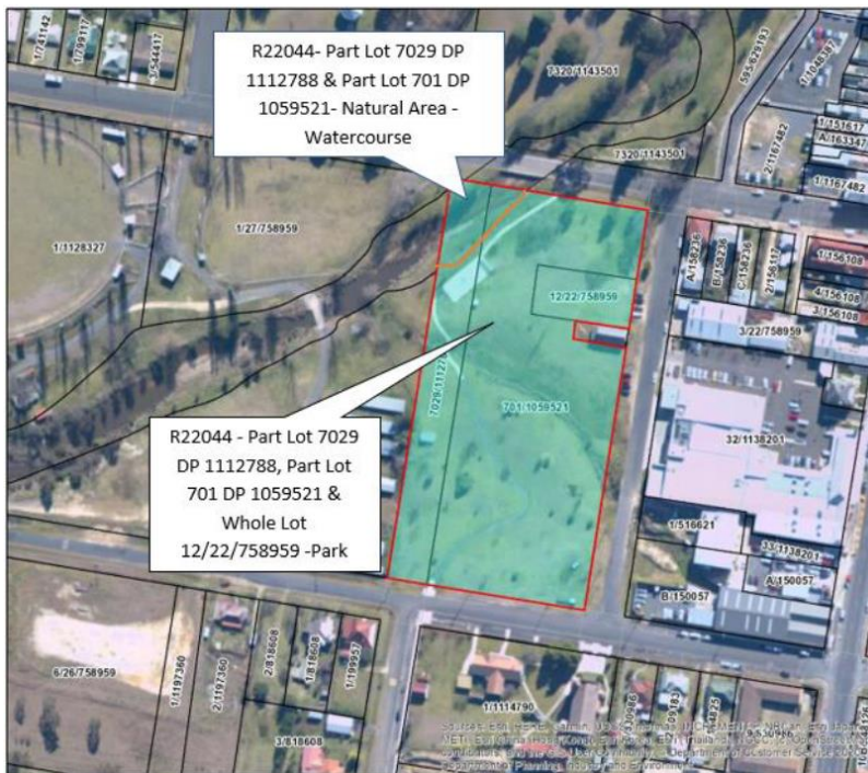
Figure 2: Categorisation of the Reserve