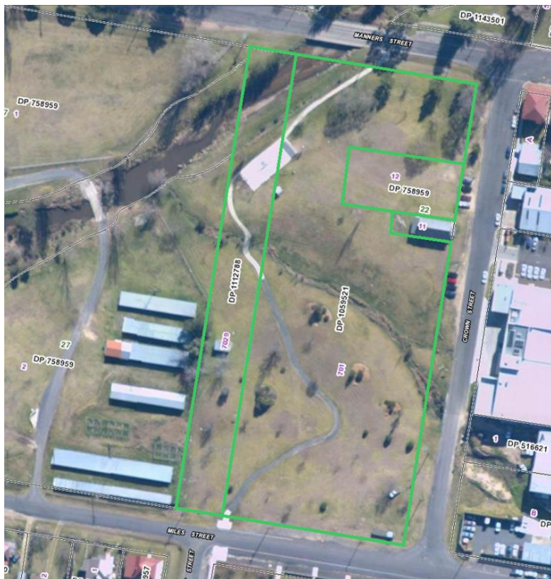
Figure 1: Land to which this Plan applies (Old Power House Reserve)

See Figure 1 below for land to which this Plan applies.