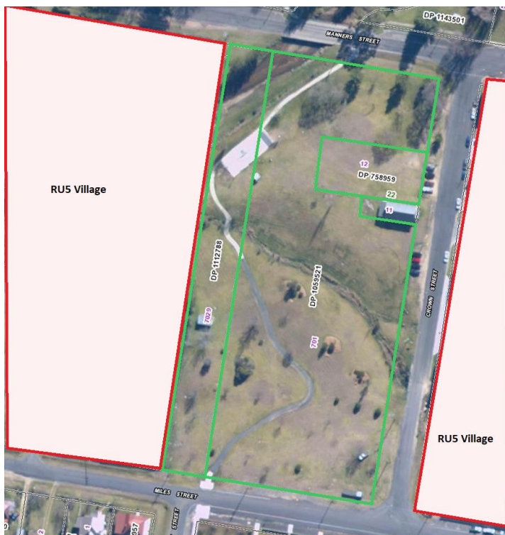
Figure 3: Land Zones

Old Power House Reserve is zoned as RU5 Village under the Tenterfield Local Environmental Plan 2013 (LEP). The reserve adjoins other lands zoned RU5 Village. Land zones are shown in Figure 3 below.