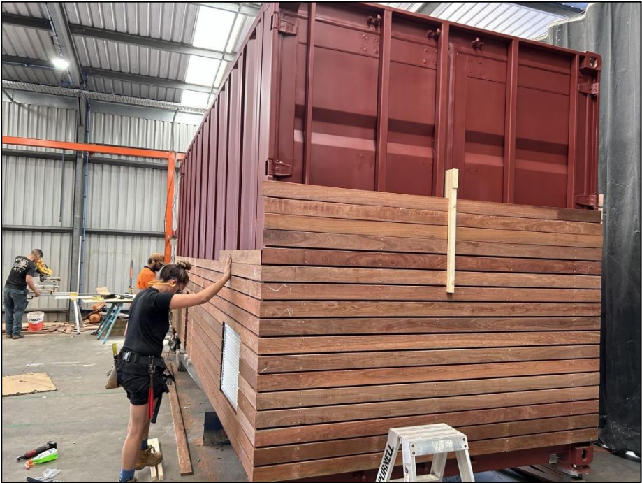
Image 3 - External cladding being fitted.