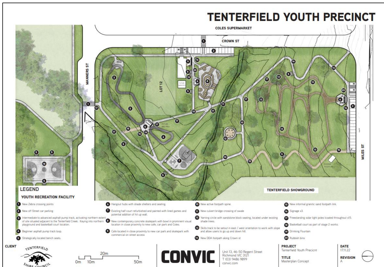
Image 1 - Convic Masterplan Concept Design

Tenterfield Shire Council has partnered with leading skate and youth precinct company, Convic, for the development and construction of the Tenterfield Youth Precinct and Mountain Bike Trailhead.