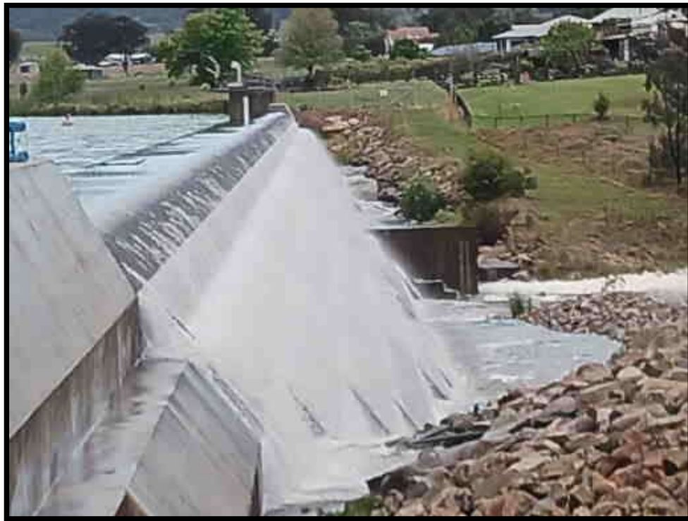
Figure 1: View of Dam Wall October 2022

Good rains and continued rainfall in January to with flooding in October and November 2021 continuing into October 2022 that have seen the dam overtopping November to January 2023 has seen a decrease in rain, with the dam stopping overtopping. As a result, we have seen a decrease in water quality and made the need for pumping water from the bores to be put on hold. The RO plant has been returned.