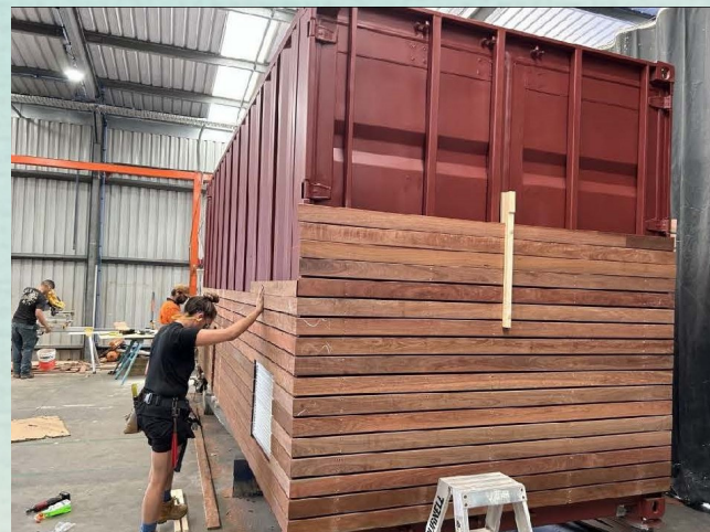
Images taken from the Youth Precinct and Mountain Bike Trailhead Container Cafe Information-Memorandum @ www.tenterfield.nsw.gov.au/more-information/tenders-expressions-of-interests