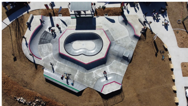
Photo: Drone photo showing the newly opened Skate Park being enjoyed

It was wonderful to see so many smiling faces, young and old, families and grandparents out with their kids – and especially to witness the moments where older kids were supporting young ones with their bikes, skateboards and scooters. The Tenterfield Youth Precinct and Mountain Bike Trailhead facility will be enjoyed by residents and visitors of the Tenterfield Shire for many years to come!