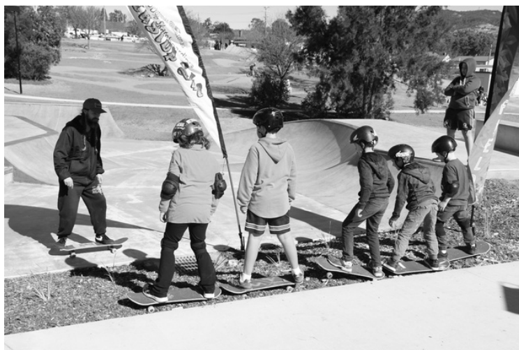
Photo: Keen young skaters receiving instruction from Truckstop Sk8