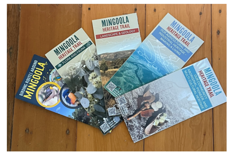
Photo: A range of brochures are available now, thanks to the efforts of volunteers