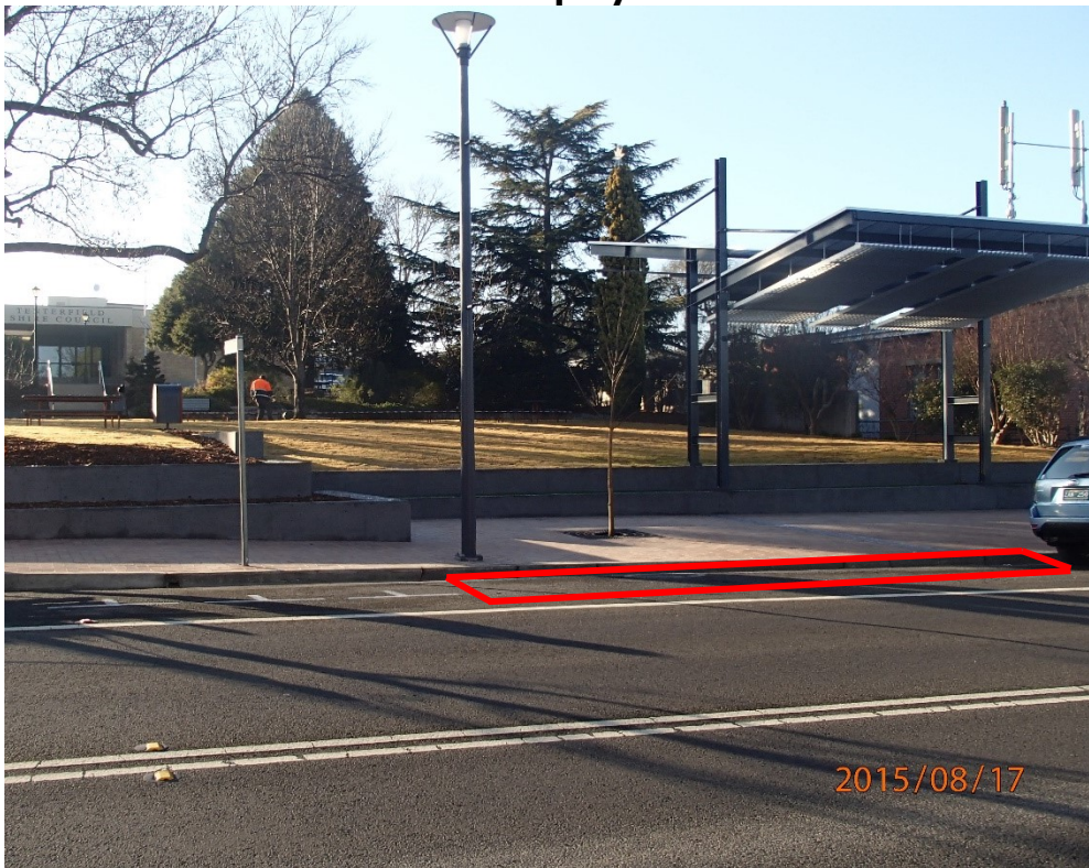
Raffle Display Area for Goods i.e. Wood Raffles