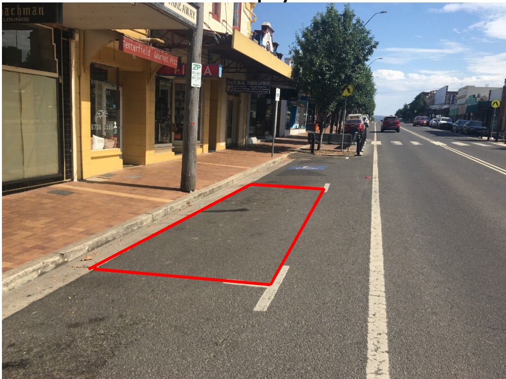
Raffle Display Area for Goods i.e. Wood Raffles