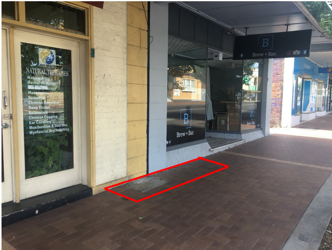
Stall Area 2.5 metres long X 1 metre deep