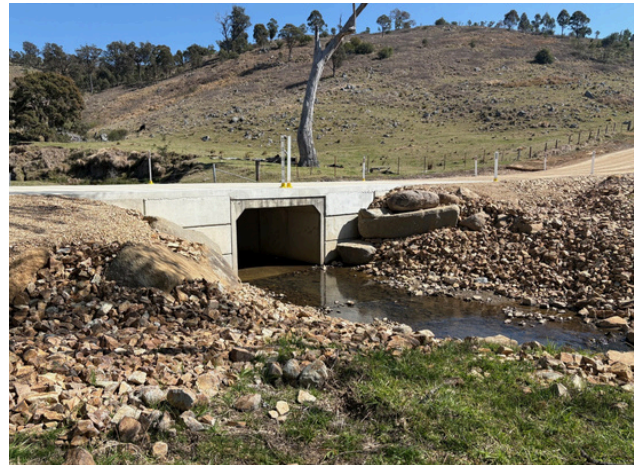
Johanna Creek Culvert, Kochs Road

Finally, a quick word of warning that snakes are now on the move so familiarise yourself with snake bite treatment and teach your children as well.