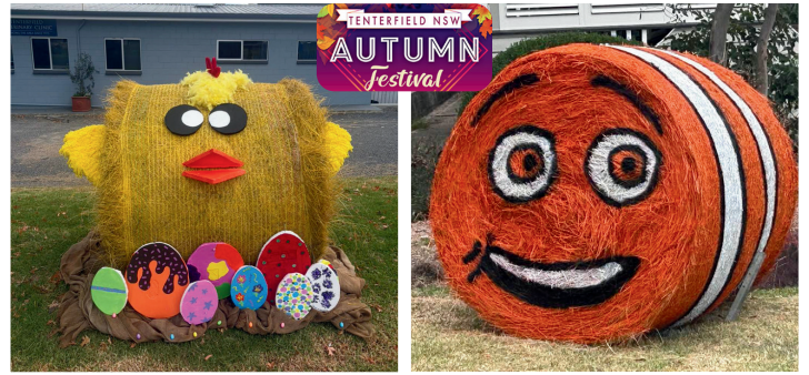
Congratulations to the Autumn Festival Committee, and sincere thanks to all event supporters, including creative hay bale decorators and local businesses, for another successful year.